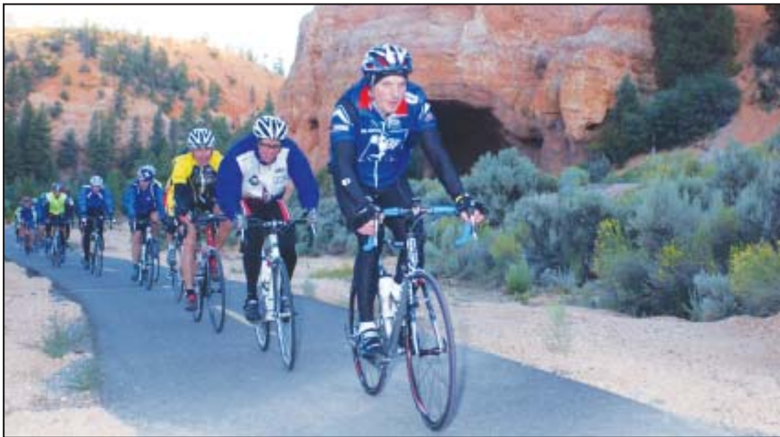
Riders near the beginning of a long day in the saddle. Photo by: Peter Wolf. See more photos at PhotoCrazy.com.