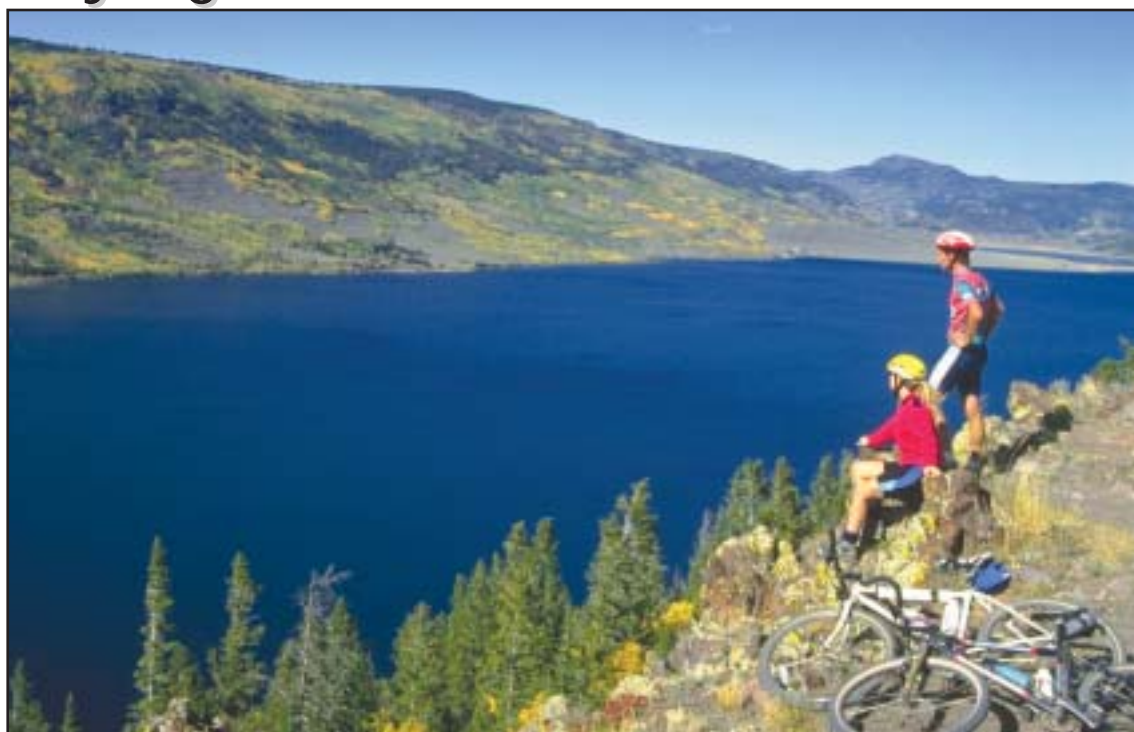
Old photo, classic ride.

Finishing touches to the Lakeshore Trail mean you can ride this 19-mile loop on all dirt, most of which is singletrack. There are steep climbs along the way and one hair-raising descent where