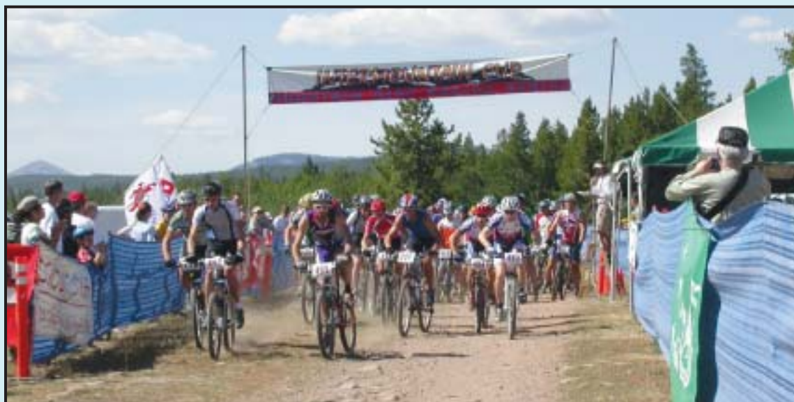
The Pro Men's Start.